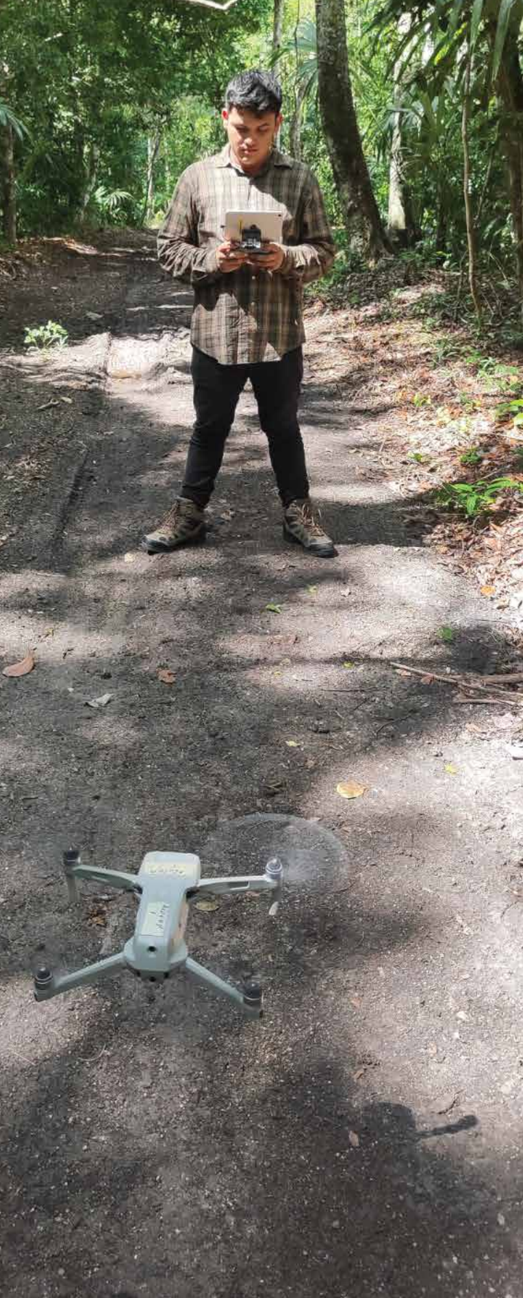
Community concession holders patrol their forests and manage threats to deforestation using drone technology.

reduction program are not only respected by the government and various voluntary or jurisdictional standards, but also formalized either in the climate change law itself or in a specific decree with indefinite validity.